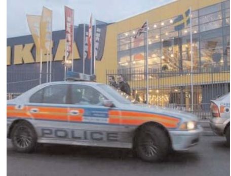
Managing brand reputation: B&Q's positive message was in stark contrast to IKEA's

and is more likely to be remembered. Why do downsizing companies produce evasive press releases and engage in corporate doublespeak when they could tell the Bridget Jones story of giving up smoking and getting down to the gym twice a week to get back in shape? Companies are now embarking on branded programming exercises – creating their own programming and channels. An example is Camp Jeep, which is run twice year in the US for Jeep owners (and paid for by them) to gather and test their vehicles to the limits. This is a potential programming property as audiences follow the thrills and spills of ordinary drivers and their Jeeps. A TV series based on Camp Jeep would create a focus for people to learn more about the products. But the real prize would be using such a programming vehicle to tell the story of where Jeep is going as a company, with so much more programming time than there is room for in an advertising campaign.